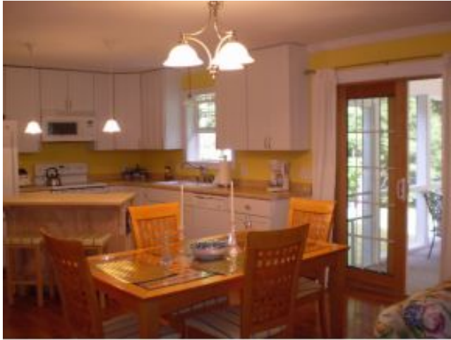
Kitchen from dining area