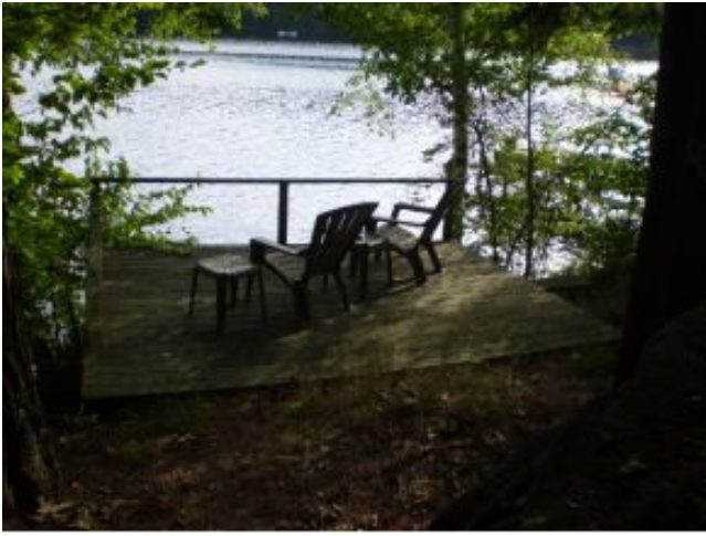
Close to Sunapee