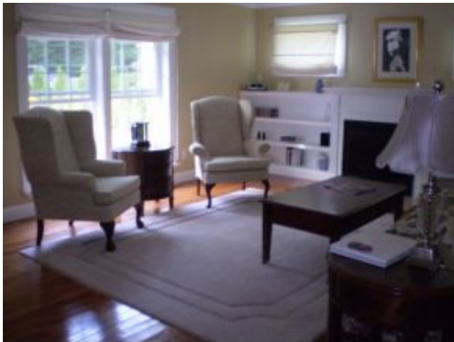
Alternate view LR