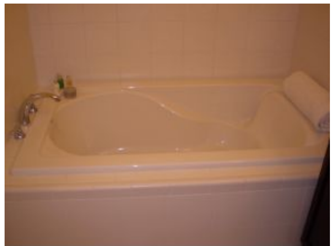
Alternate view tub